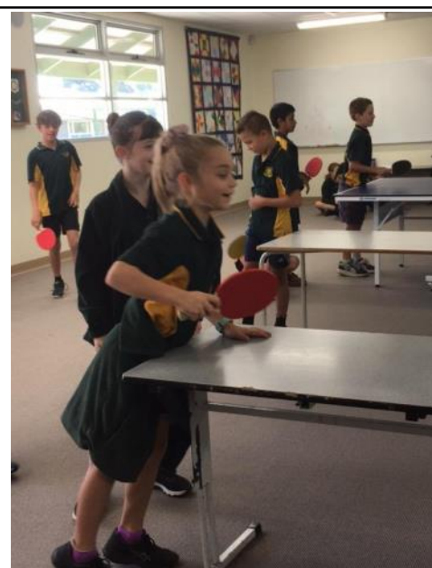
TABLE TENNIS SKILLS this term.