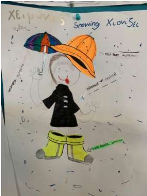
The Weather: Did you know that the Greek and English word for Umbrella sounds the same? :)